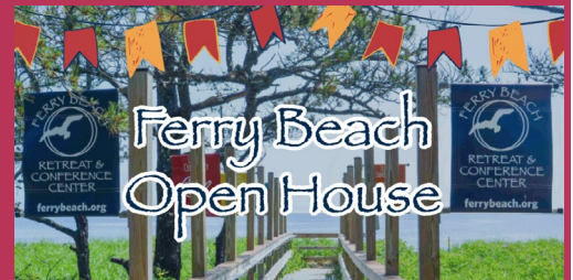
Learn more at: ferrybeach.org/open-house

After this event, we'll have our Annual Meeting (note-the annual meeting is only for Ferry Beach members during 2023). Town Hall begins at 11am, followed with lunch and the meeting at 1:15pm.