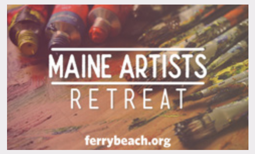
December 6-8, 2020