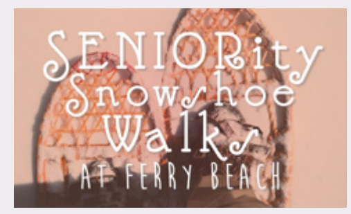
Beginning on December 16th