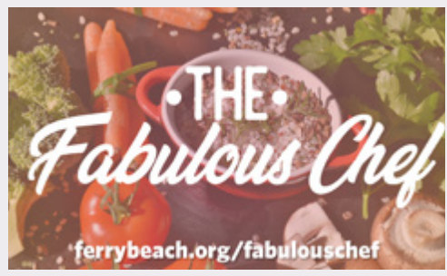
Various Dates this Fall & Winter