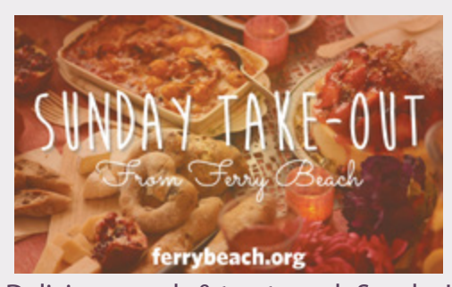
Delicious meals & treats each Sunday!