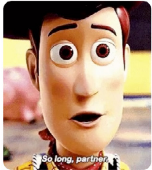
Like - Reply - Message - 2d