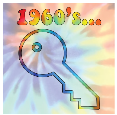
Here are the keys - Lock up when you're all done.

Over the course of our long history, Ferry Beach has been home to many groups. Long before there were fire regulations and insurance to maintain, it was pretty easy to host an event here. Staff or volunteers (before there were staff!) would just hand the keys to the group and say "lock up and turn the lights out when you leave." Today, there are many more regulations we need to follow, and many of those keep us safe and sustainable.