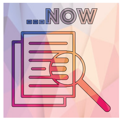
Please read all of the fine print and sign the Use Agreement.