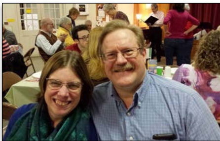
they work to continue the

“In our wills, we have designated a percentage of our estate for Ferry Beach. It has been a longtime spiritual practice for us to donate a percentage of our annual income to organizations and institutions whose values and work are important to us. It makes sense to continue that practice with our financial assets when we die. We have no clear idea what challenges and opportunities will present themselves for Ferry Beach in the future. Our legacy gift to the endowment is to help ensure that FBPA’s leaders are on solid financial footing as