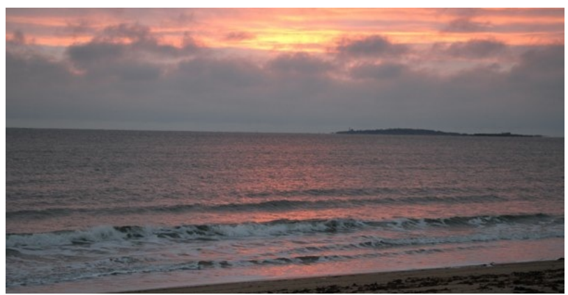
Sunrise on the winter solstice, 2014. CS