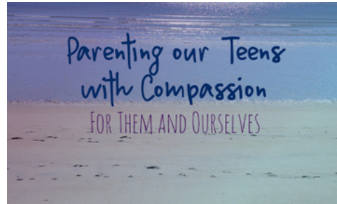
FEB 3-4: ferrybeach.org/parenting