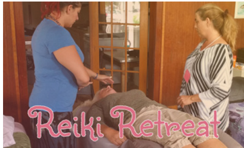
FEB 23-25: ferrybeach.org/reiki