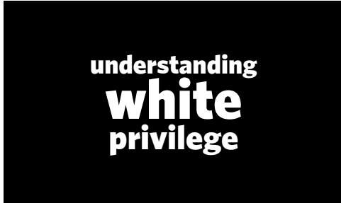
FEB 3-4: ferrybeach.org/wp

Now that the holidays are over, you can start thinking about some rest and relaxation at the beach again! Though it's not as warm and sunny as we would all like, there are still some great programs taking place with plenty of warm and cozy overnight lodging options. For complete program details, visit www.ferrybeach.org/winter