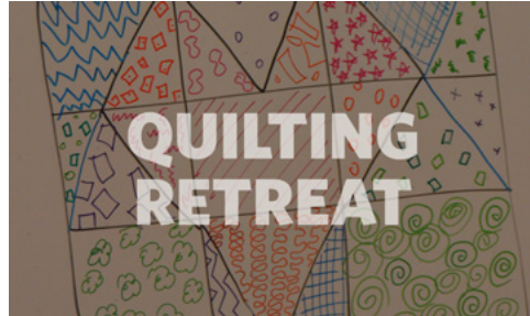
FEB 16-19: ferrybeach.org/quilting